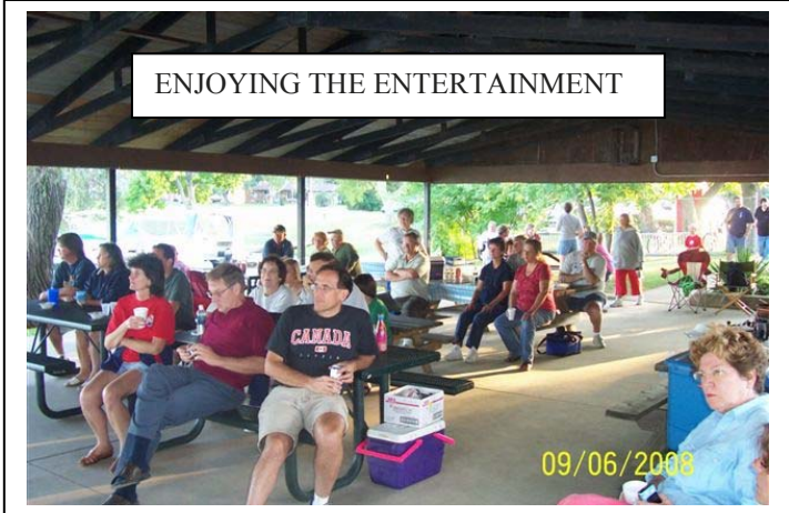
ENJOYING THE ENTERTAINMENT