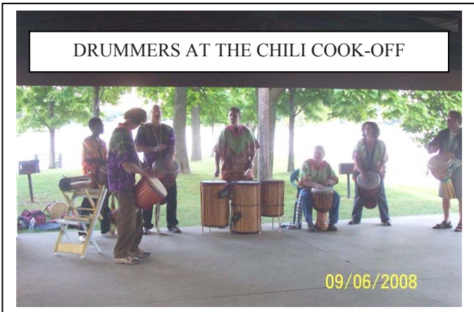
DRUMMERS AT THE CHILI COOK-OFF