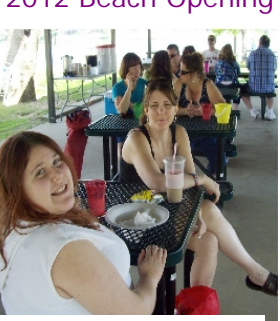
On the right are two of the winners in the fishing contest.