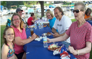
Potluck Dinner before the Fireworks