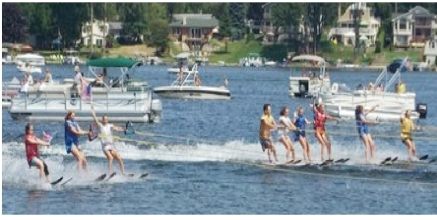
SKI SHOW WITH THE SKI DEMONS JUNE 30th