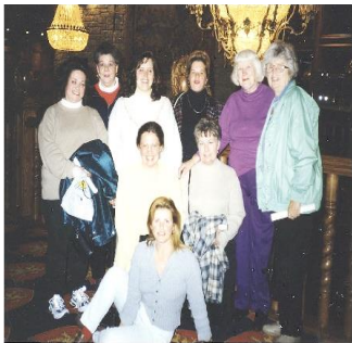
October 15, 1999, Noon Meeting at Centerbury Village's "Kings Court"