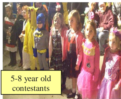
5-8 year old contestants