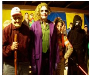
Some adult contestants