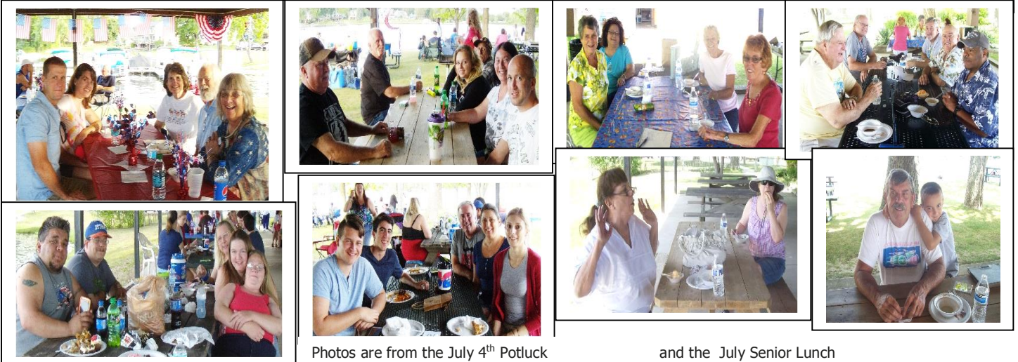
Photos are from the July 4 th Potluck