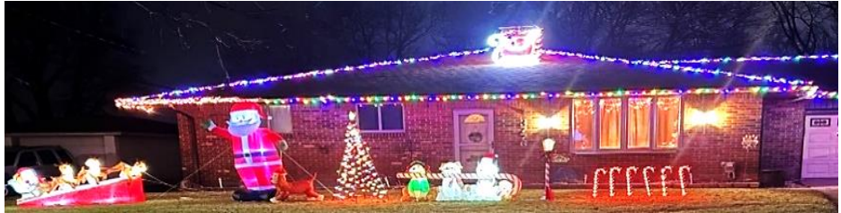
Rooney's on Mariner – Best Overall